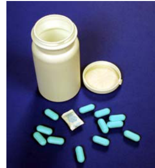
Süd-Chemie's desiccant packets are ideal for preventing moisture damage in small, sealed packages, such as pharmaceutical bottles, shown above.

(Turn over for technical usage and performance data)